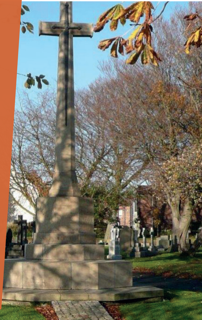
Rake Lane Cemetery

The change in planting strategy has reduced maintenance costs, but has also meant that all year round at least one area of the site will be in full bloom – attracting biodiversity as well as providing a pleasant display for visitors.