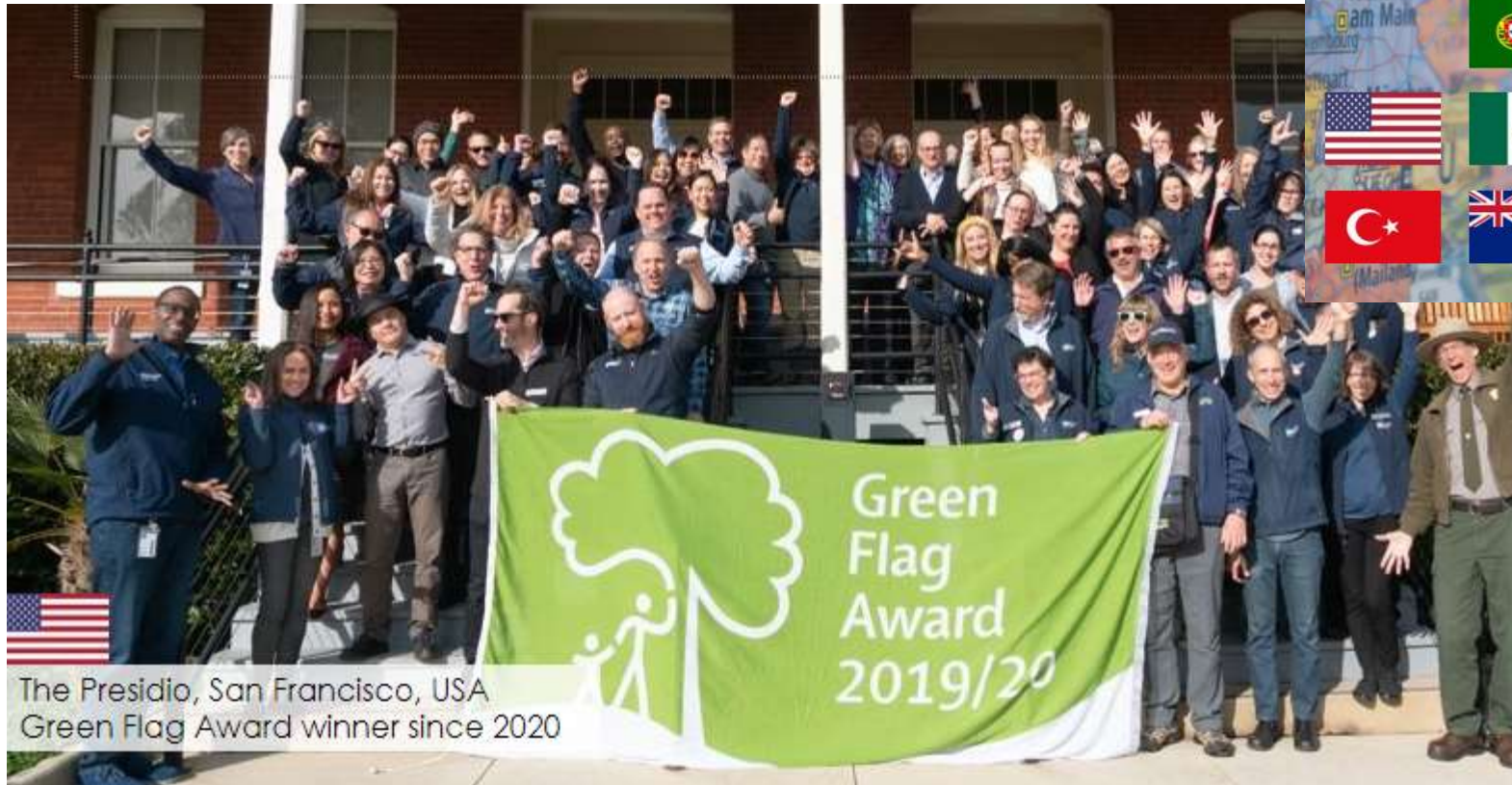
The Presidio, San Francisco, USA Green Flag Award winner since 2020